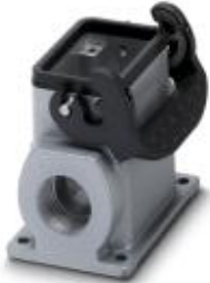
Figure shows product with height of 74 mm

Box mounting base, with single locking latch, height 52 mm, without screw connection, 2x Pg16