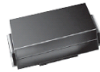
SMA ( DO - 214AC )