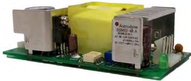
2"W x 4"L x 1.244"H