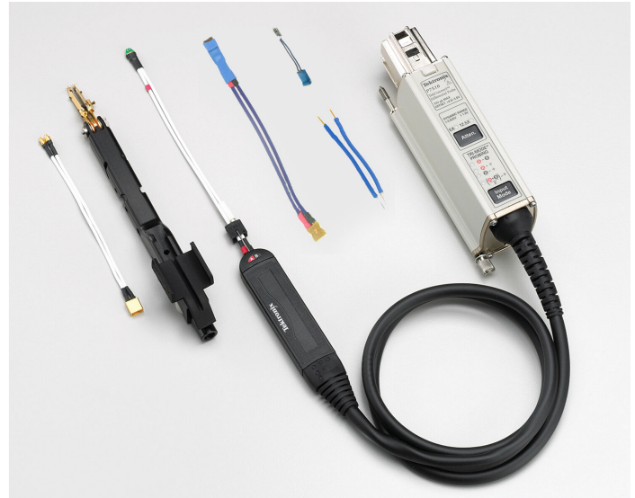
P7500 Series TriMode™ probe.

TLA7000 Series logic analyzer and Logic Probes Connection to the oscilloscope through Analog Mux. See www.tektronix.com/logic_analyzers