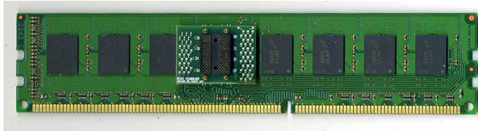
BGA Interposer probing solution for DDR2/DDR3

TLA7000 Series logic analyzer and Logic Probes Connection to the oscilloscope through Analog Mux. See www.tektronix.com/logic_analyzers