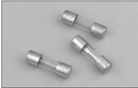
Dimensions - in