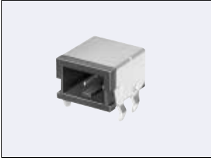
TCP7335-010177 Half Lock Type