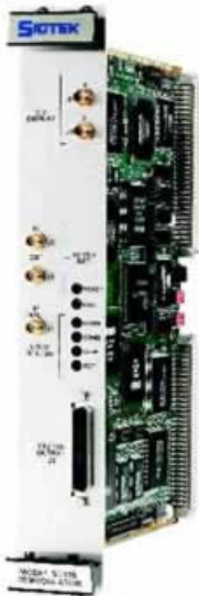
Double width VME: 6U x 160mm